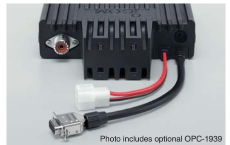
Photo includes optional OPC-1939

With the optional OPC-1939 D-SUB 15-pin ACC cable, the IC-F5026/H series can be programmed to control an operating channel from an external device (up to 16 preprogrammed channels). The ACC connector also provides an ignition sensing function, external PTT, PC command, horn honk, audio output and modulated signal input depending on programming.