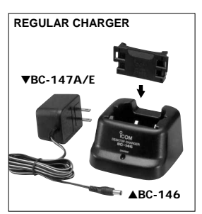
BC-146 DESKTOP CHARGER + BC-147A/E AC ADAPTER Charges the battery pack, BP-209, BP-210 or

BP-222 with/without transceiver in 12, 18.5, 6.5 hours (approx.), respectively. The BC-147 AC ADAPTER is additionally required.